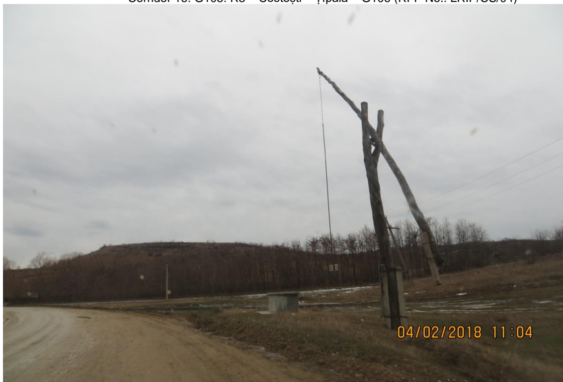
Between villages Pojăreni and Costești