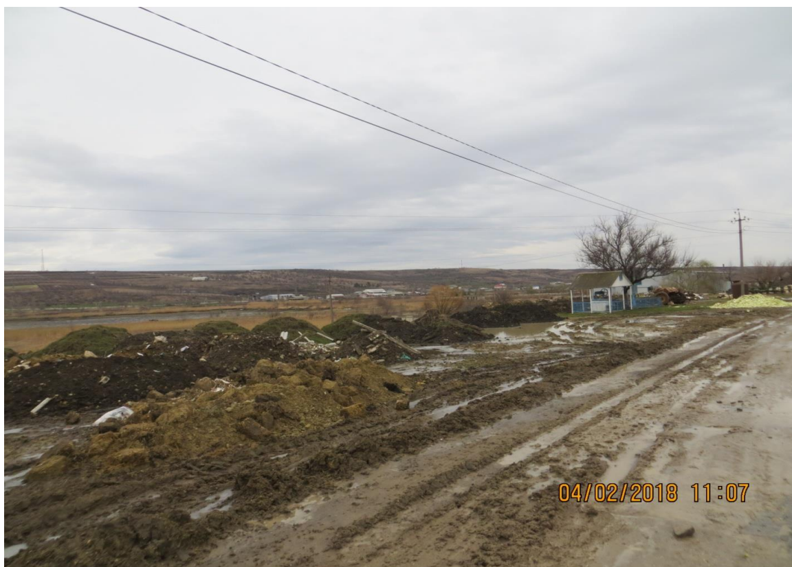
Start of the village Costești